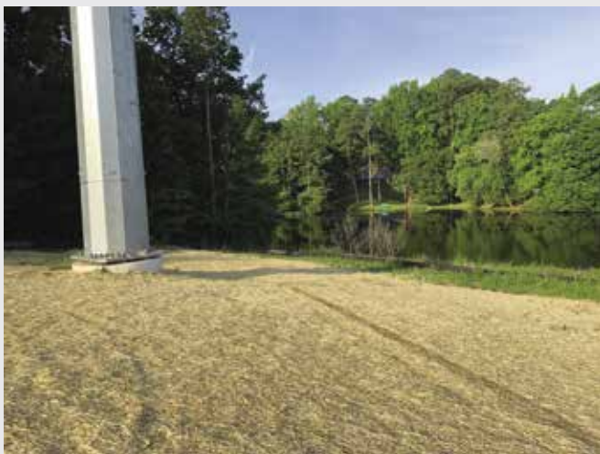
▲ Work pad stabilized with seed and straw after construction was completed.

representative monitors progress and inspects the site once the installation is complete. Once the site aligns with the site plan, construction can begin. The oversight representative will periodically inspect the site to ensure the controls are in working order during construction. These inspections are logged in the SWPPP and updates are made as required. If repairs or changes need to be made, the representative will take action to ensure compliance. During this time, the site may be inspected by internal or external parties. These inspections are to ensure that the site meets the requirements dictated by the permit and regulatory bodies. The consequences of a failed inspection can mean the revocation of a permit and/or fines. This can completely stop the project and lead to costly remediation. Maintaining compliance is vital, and having an oversight representative keeps the project on track.