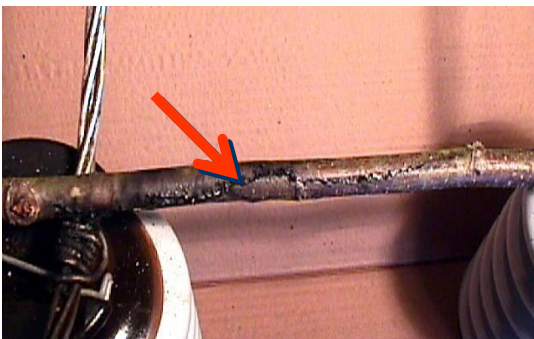
Figure 4. A completed carbon path, fault occurred

In their discussion of the “Conceptual Model of the Electrical Mode of Failure” in the 1998 report ECI states; “The electrical stress at the point(s) of contact are due to unequal potential across the conductor surface, branch surface (outer bark), inner bark (cambium), and xylem (wood). The electrical stress causes arcing; a high energy point discharge. Heat energy generated from the arc is sufficient to cause breakdown of organic compounds (cellulose and lignin) into elemental carbon and charcoal. The carbon generated is relatively conductive as compared to branch tissue.” iii