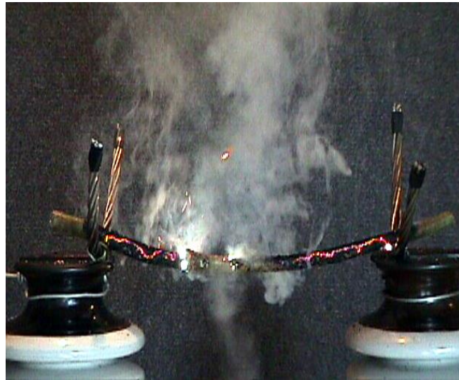
Figure 3. Formation of the carbon pathway prior to flash over

When we take a moment to examine this, intuitively it makes sense. Wood has some higher level of resistance that must be overcome for a short circuit to occur. Most utility arborists have seen energized primaries on wooden cross arms and